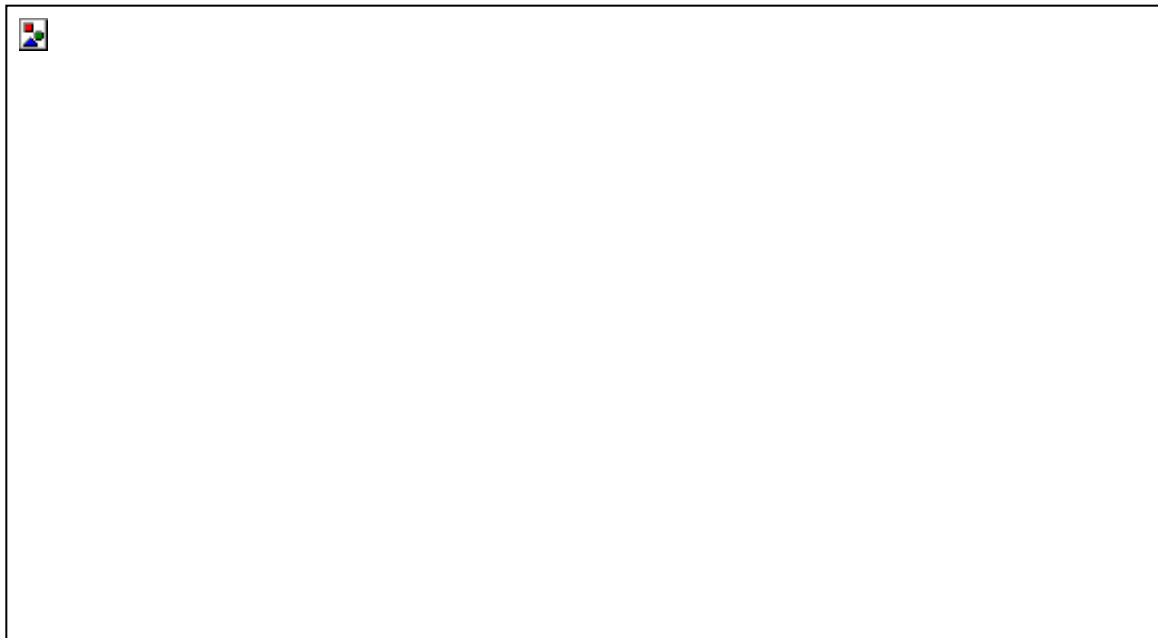
Figure 2. Treatment effects on spring wheat grain yield and plant density averages (3-site years: Swift Current, Melfort and Outlook, 2021). With the exception of the Nitrogen-fixing treatment, yield increased with plant density.